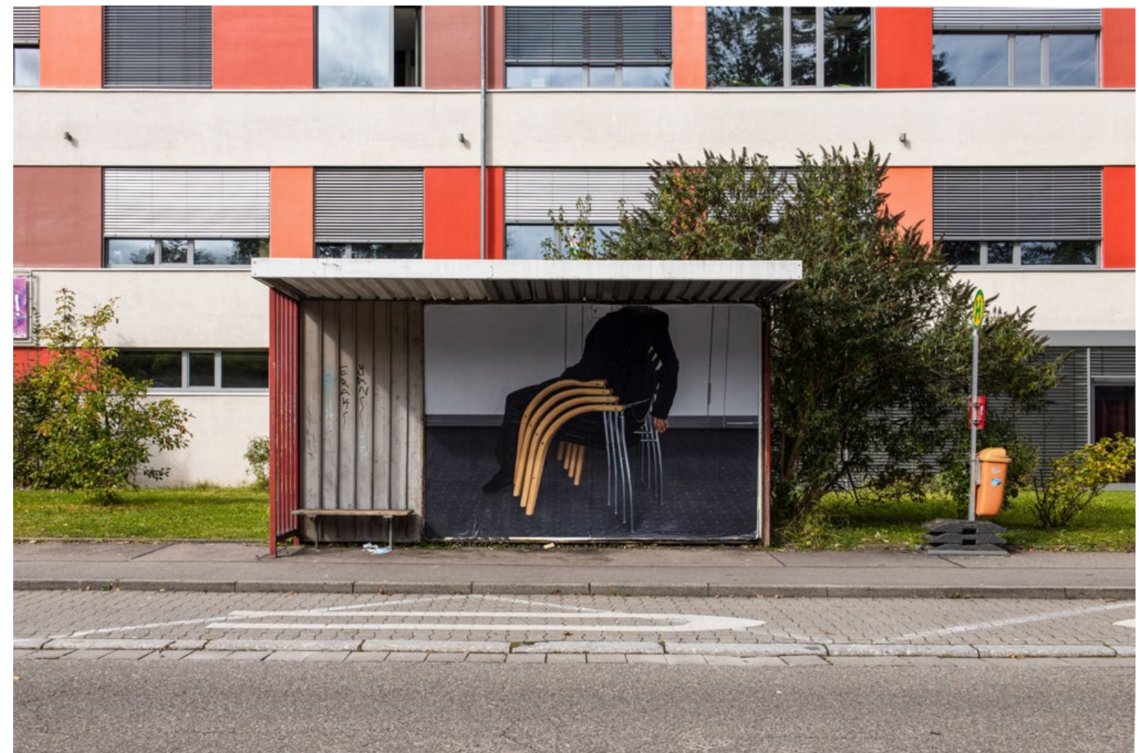
Installation views Billboards around the Museum für Neue Kunst Freiburg